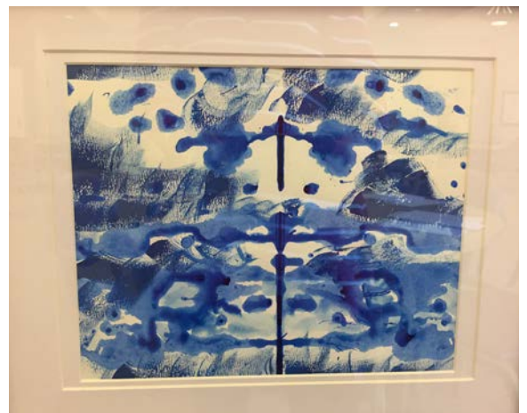
Highlights from the Cathy Weiss Gallery Naming See page 5 for more images