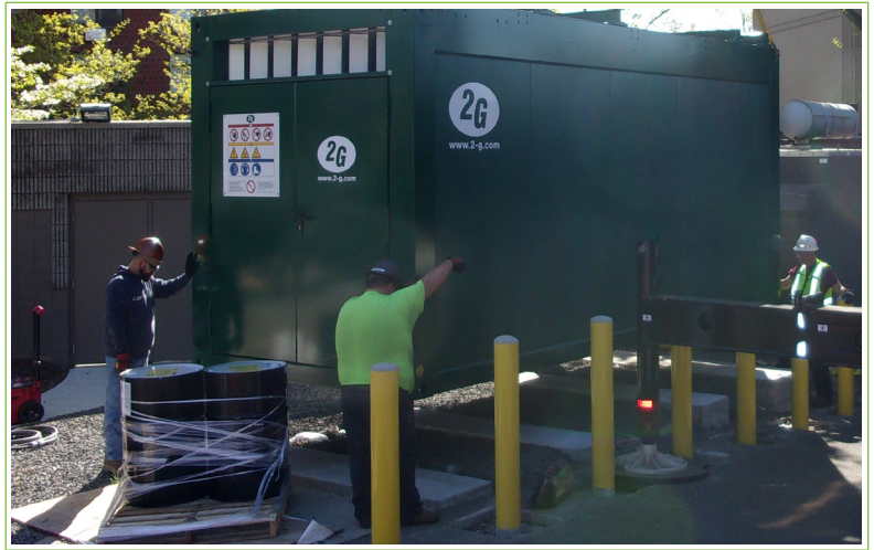
The co-generator is delivered to The Towers