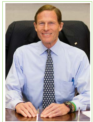
Senator Richard Blumenthal

Please join us for a thank you event with Senator Blum-